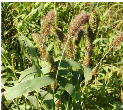
Figure 5. Foxtail millet head stage.

Foxtail millet (German millet) is fine stemmed, has no prussic acid potential and is well suited for hay-making (Figure 5). Susceptibility to sugarcane aphid is not known. It is the lowest yielding of the summer annual grasses since it will not regrow after cutting. It is a good smother crop to be used before no till seeding another crop such as fescue or alfalfa. Foxtail millet is also used as a wildlife planting to produce food and cover for doves, quail, and other birds. For more information, see AGR-233: "Foxtail Millet."