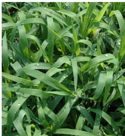
Figure 7. Crabgrass.

Crabgrass is sometimes considered a weed, but possesses significant potential for supplying high quality summer forage (Figure 7). Crabgrass does not have prussic acid potential and is a poor host for the sugarcane aphid. Crabgrass is the general term for many Digitaria species. Commercial seed usually contains Digitaria sanguinalis (large or hairy crabgrass) or D. ciliaris (southern crabgrass). A primary advantage of crabgrass is that it is well adapted to Kentucky and occurs naturally in most summer pastures, especially those that have been overgrazed. It is also highly palatable and a prolific reseed. Planting an improved variety of crabgrass is recommended because the production of naturally occurring ecotypes varies greatly. Crabgrass is best utilized by grazing. For more information, see AGR-232: "Crabgrass."