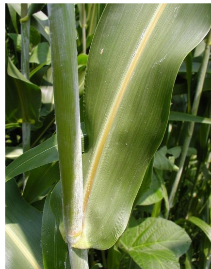
Figure 8. The brown midrib trait in forage sorghum.

The brown midrib or BMR trait is outward expression of a genetic mutation in forage sorghum (Figure 8), sorghum-sudangrass, sudangrass, and pearl millet. In most cases, plants possessing the BMR trait contain less or altered lignin, making the plant more digestible and increasing animal production. Therefore, it is desirable to seed summer annuals that have the BMR trait in addition to other desirable characteristics such as high yield. With BMR varieties, the midrib of the leaf appears brown or tannish in color.