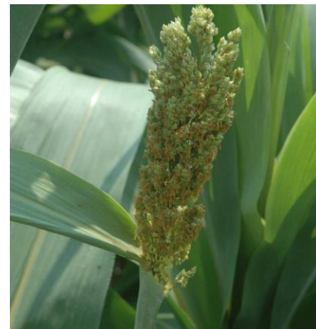
Figure 4. Forage sorghum head stage.

Forage sorghum can reach heights of 6 to 15 feet and is best harvested as silage (Figure 4). Taller varieties produce high forage yield but can lodge, making them difficult to harvest mechanically. Some varieties have been developed that are shorter with increased resistance to lodging. Like corn, forage sorghums are harvested once per season by direct chopping. While forage sorghum yields are similar to corn, they are lower in energy. The primary advantage of utilizing sorghum for silage production is its greater drought tolerance. For more information, see AGR-230: “Forage Sorghum.”