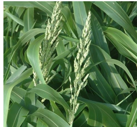
Figure 2. Sudangrass.

Sudangrass is a rapidly growing annual grass of the sorghum family. It is medium yielding and well suited for grazing (Figure 2). Sudangrass regrows quickly after harvest and can be grazed several times during summer and early fall. This grass has finer stems than most other summer annuals making it well suited for hay production. For more information, see AGR-234: “Sudangrass and Sorghum-sudangrass Hybrids.”