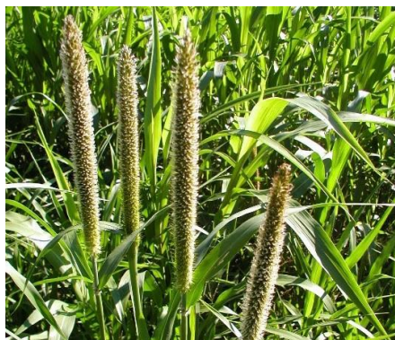
Figure 6. Pearl millet head stage.

Pearl millet is not related to foxtail millet and is higher yielding. It will regrow after harvest, does not have prussic acid potential and is not a host of the sugarcane aphid (Figure 6). Dwarf varieties are available which are leafier and better suited for grazing. Pearl millet is better adapted to more acid soils and soils with a lower water holding capacity than sorghum, sudangrass or sorghum-sudangrass hybrids. For more information, see AGR-231: "Pearl Millet."