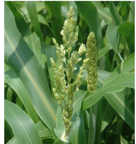
Figure 3. Sorghum-sudangrass head stage.

Sorghum-sudangrass hybrids are developed by crossing sorghum with true sudangrass (Figure 3). The result is a tall growing annual grass that resembles sudangrass, but has coarser stems, taller growth habit, and higher yields. Like sudangrass, hybrids will regrow after grazing if growth is not limited by environmental factors. The coarse stems are difficult to cure as dry hay, therefore these grasses are best utilized for grazing, chopped silage and baleage. For more information, see AGR-234: “Sudangrass and Sorghum-sudangrass Hybrids.”