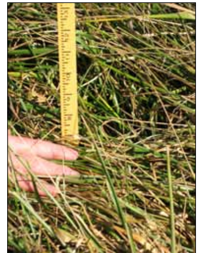
Figure 1. Ruler used to measure height.

Keep in mind the estimate is only as good as the sample. If the forage stand and the topography are uniform, a minimum of one sample per acre is recommended. Take more measurements for fields with variable soils, topography, or forage stands.